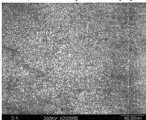
Figure 1 Typical TEM image of silver nanoparticles in the hybrid films

A representative transmission electron microscope (TEM) image of silver nanoparticles is shown in Figure 1, which proved the generation of nanoparticles with a unified shape. The resulting particles, which have an identical size of 6.4nm, were well dispersed in the polyimide matrix without aggregation.